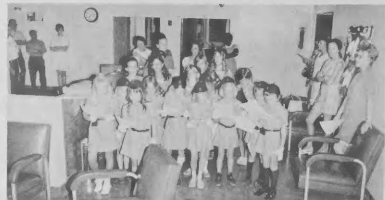
Continuando un tradicion ■ varios anja, Padvindsters di Seroe Colorado atrobe ■ trece ambiente di Pascu pa ■ pacientnan di Lago Hospital cu nan canticanan di Pascu.